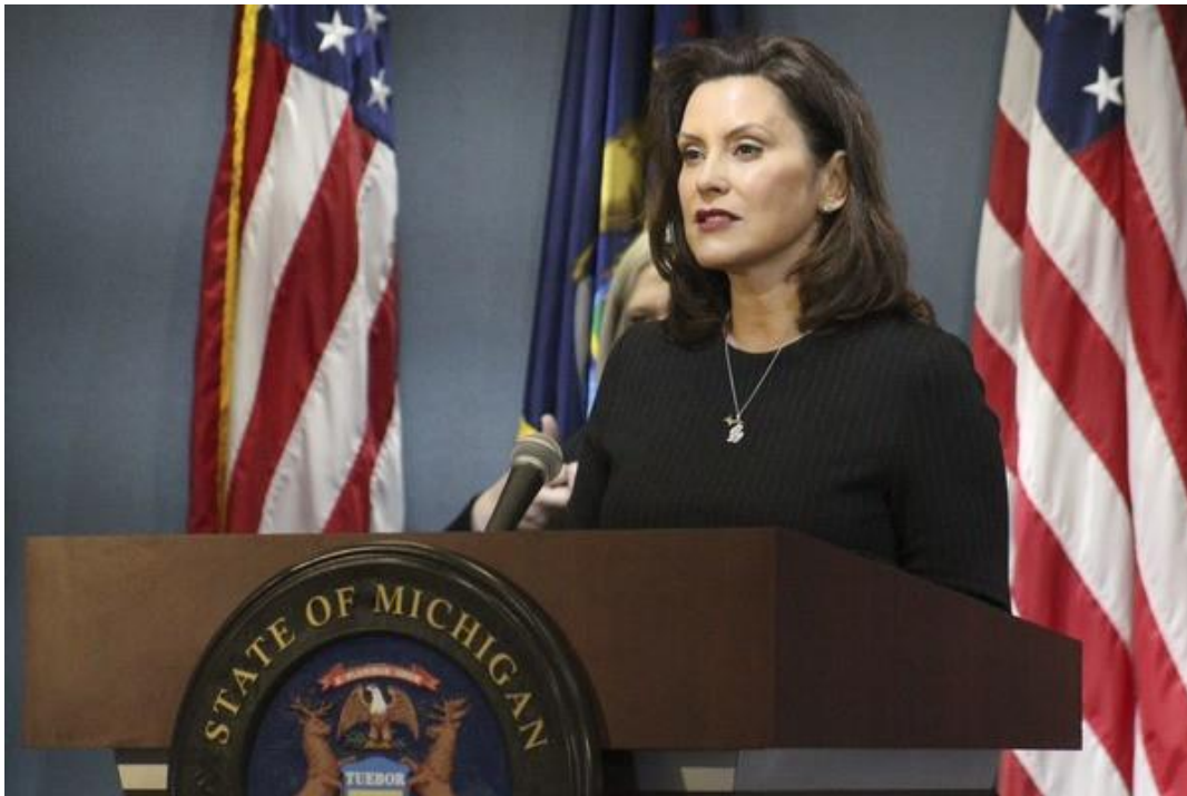
Governor Gretchen Whitmer has not issued any new Executive Orders since our last update (hyperlinks below with recent EOs).