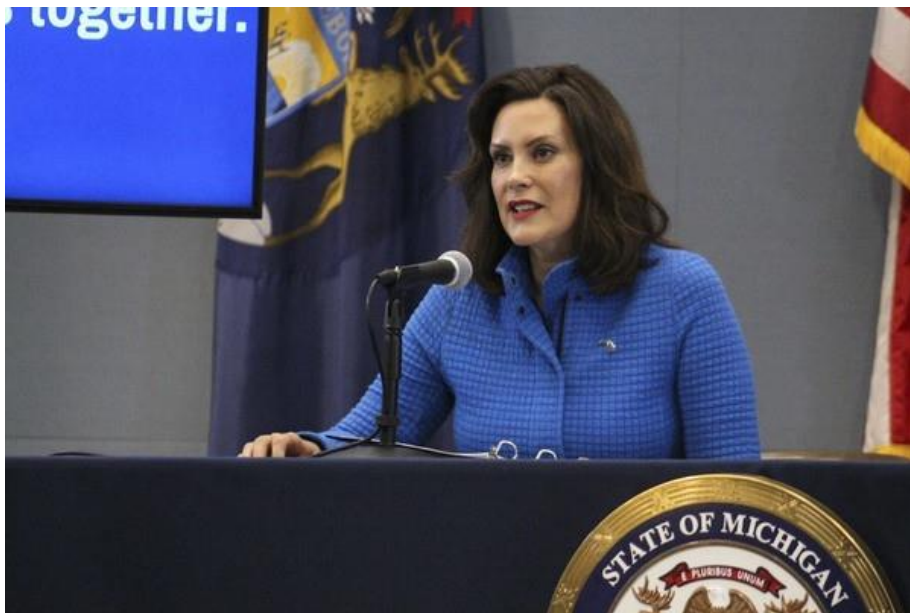
Governor Gretchen Whitmer has not issued any new Executive Orders (hyperlinks below with recent EOs).