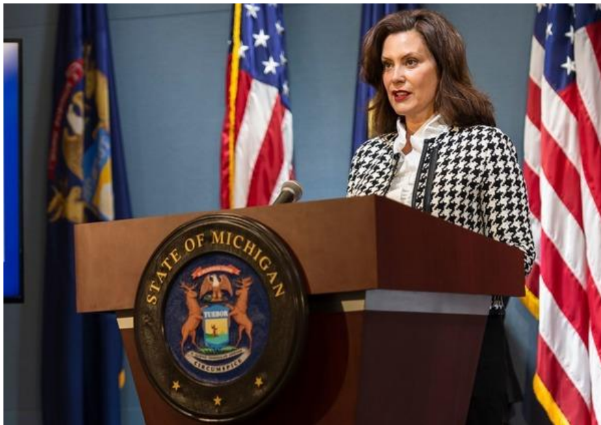
Governor Gretchen Whitmer has not issued any new Executive Orders (hyperlinks below with recent EOs).