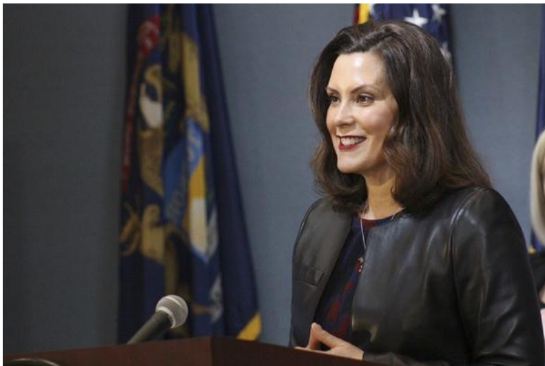
Governor Gretchen Whitmer has not issued any new Executive Order ( hyperlinks below with recent EOs ).